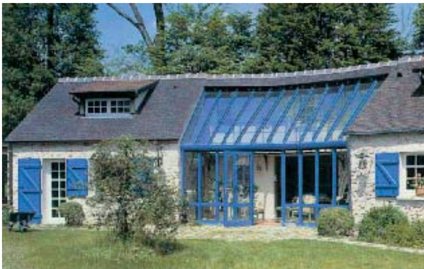
Aluminium veranda, windows and blinds

Intelligent facades incorporating aluminium systems can decrease energy consumption in buildings by up to 50%. The key feature of these intelligent buildings is their constructive interaction with the exterior, markedly reducing heating, cooling, ventilation and lighting energy demands. This is achieved through numerous techniques and processes including photovoltaics, optimised ventilation mechanisms and appropriate light and shade management.